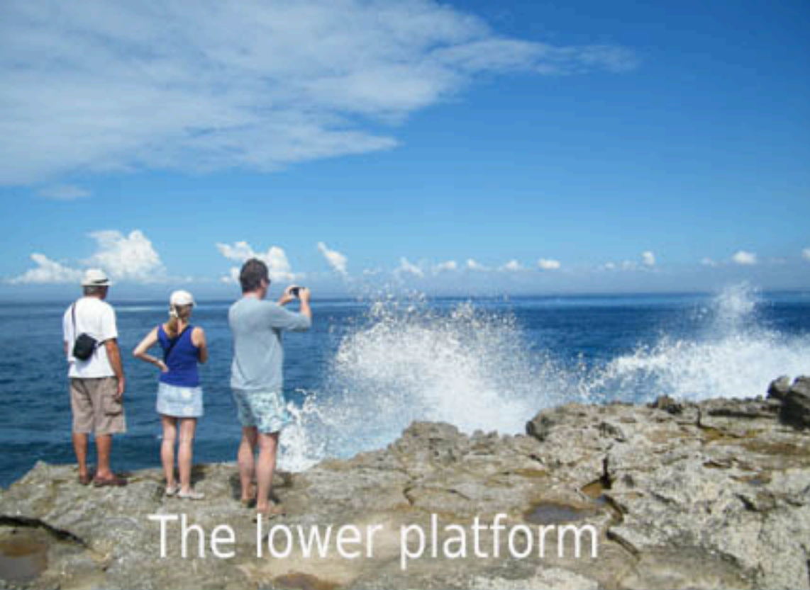
The lower platform