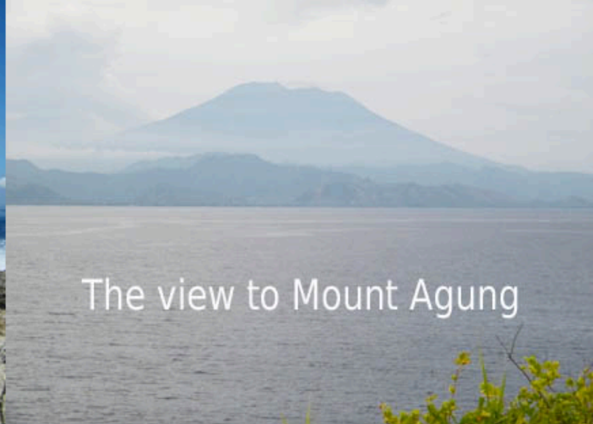
The view to Mount Agung