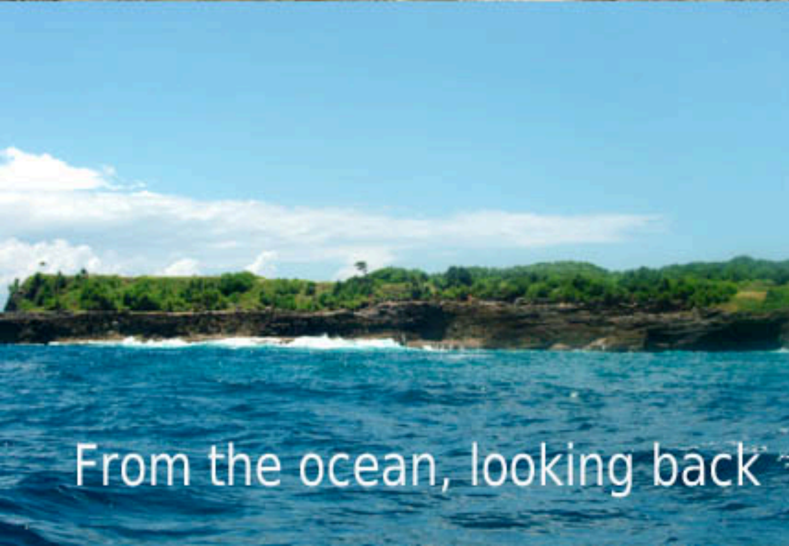
From the ocean, looking back